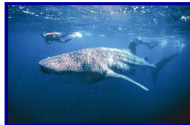
Whale Sharks Ningaloo Reef

This region is a treasure trove of beaches, exotic marine life, national reserves and the bluest ocean you'll see anywhere in the world. Stretching from Cervantes up to Exmouth, Australia's Coral Coast offers some amazing adventure experiences. Here you can swim with the world's largest fish - the whale shark, snorkel from the beach to the stunning Ningaloo Reef, meet the dolphins of Monkey Mia and take in the Pinnacles - a West Australian icon. The Abrolhos Islands offer snorkellers and divers pristine coral and magnificent marine life. There are also the sea lions of Leeman, gorges of Kalbarri, blow holes of Carnarvon, and the colourful wildflowers that annually carpet much of the region. In addition, the off-road adventures and the beach and offshore fishing in places like Coral Bay, Denham and Exmouth are second-to-none.